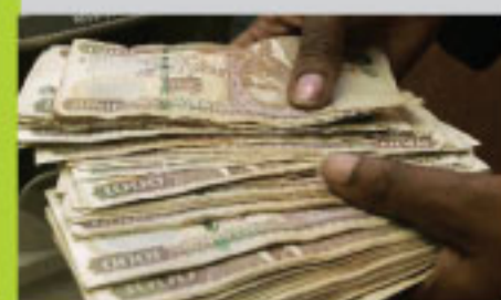
Raise & Bank