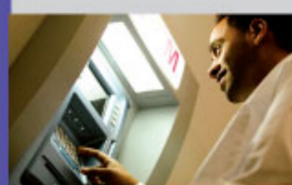
ATM Cash Management