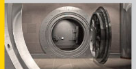
G4S Cash Management